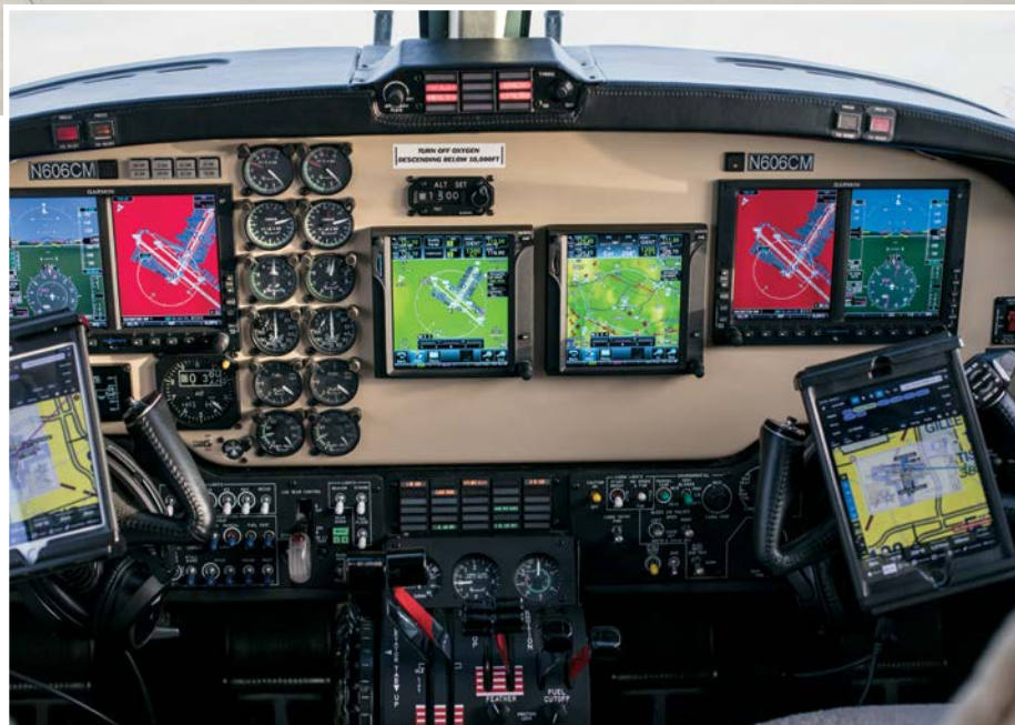
A new instrument panel was installed, by Stevens Aviation in Nashville, with Dual Garmin G600s and Dual GTN-750s.

The Raisbeck wing lockers have provided plenty of room for hauling surfboards, mountain bikes and skis